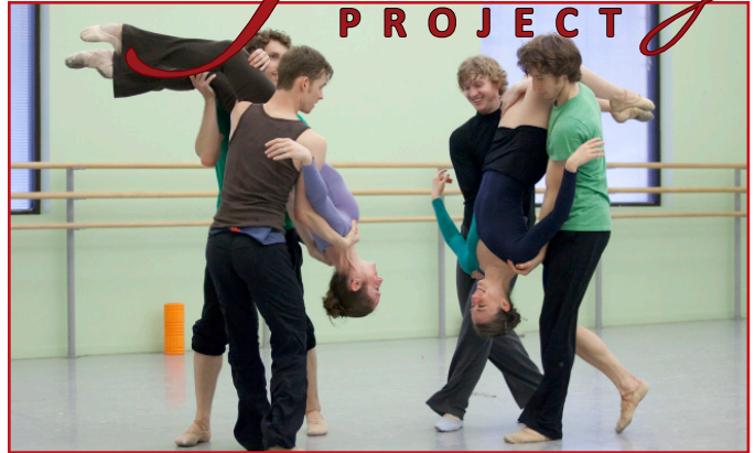
The Stravinsky Project in rehearsal.