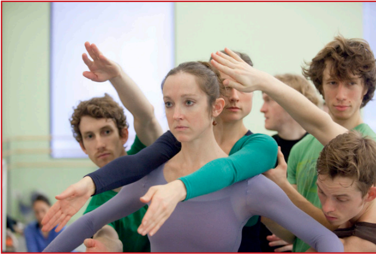
The Stravinsky Project in rehearsal.