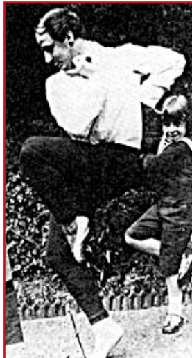
Michel Fokine and son Vitale posing in 1910