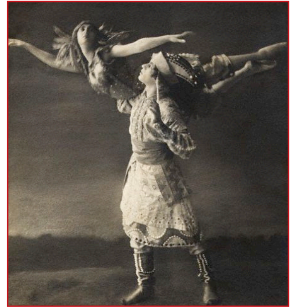
Original production of Firebird

One hundred years ago, a ballet company called Ballets Russes emerged to change the world of performance art. Visual artists, composers and choreographers joined forces in order to create new works of art. Resident choreographer Michel Fokine worked with 27 year old composer Igor Stravinsky to create Firebird , premiering it in Paris in 1910. (Stravinsky was paid 100 rubles for the score, about the price of a Diet Coke in St. Petersburg these days.) Firebird would be the start of Stravinsky's long and groundbreaking career as a composer for ballet. An artist steeped in his time, Fokine was influenced by concepts from a revolutionary dance form sweeping Europe, entitled modern dance . His Firebird choreography included bare feet and inwardly rotated legs along with traditional ballet steps. In Firebird , Russian folklore of old came to life with bold movement, fresh scenic choices, and Stravinsky's score, reflecting sensibilities of the time, yet pushing ballet to the future. Dance companies, like OBT, continue to enlist current choreographers to create new versions of Firebird , so compelling is the music and story.