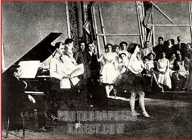
Stravinsky and Fokine in collaboration